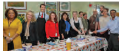
Annual Public Service Week was celebrated with service recognition events, an ice cream social where leaders served staff, and virtual events.