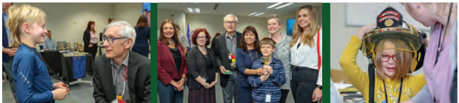
Take Your Child to Work Day participants