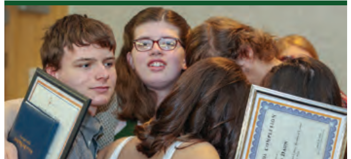
Project SEARCH interns from Mercy Medical Center in Oshkosh celebrate their graduation from the program.