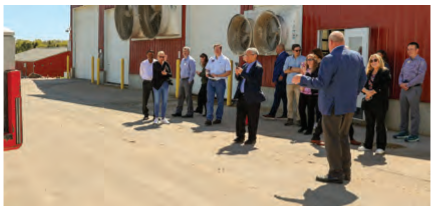
Task force members got a close-up look at AI and technology in agriculture at the Agriculture Center of Excellence, a working dairy farm and learning laboratory run by Northcentral Technical College in Wausau.