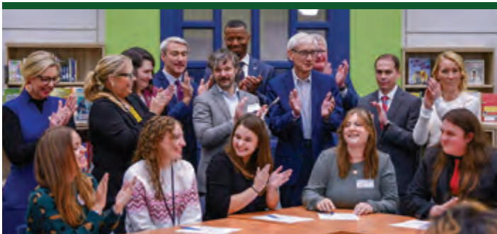
Gov. Evers congratulated the first group of teacher apprentices and their sponsoring employer school districts, Appleton, Elmbrook, Greendale, and Wauwatosa, at a signing ceremony in November.