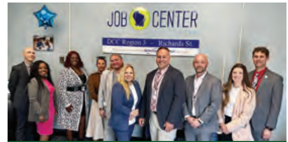
The first job lab at a Milwaukee probation and parole office helps individuals prepare and find work.